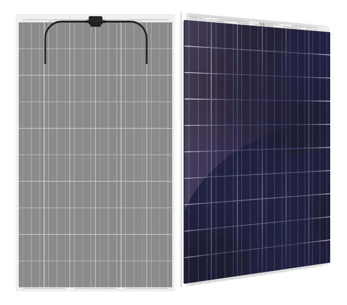
Figure 1 Glass-Glass pv module visualization of front and back sides